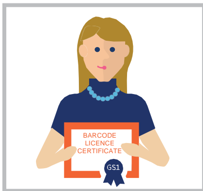
Step 2: Receive your certificate and licence details