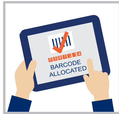
Step 3: Generate your barcodes